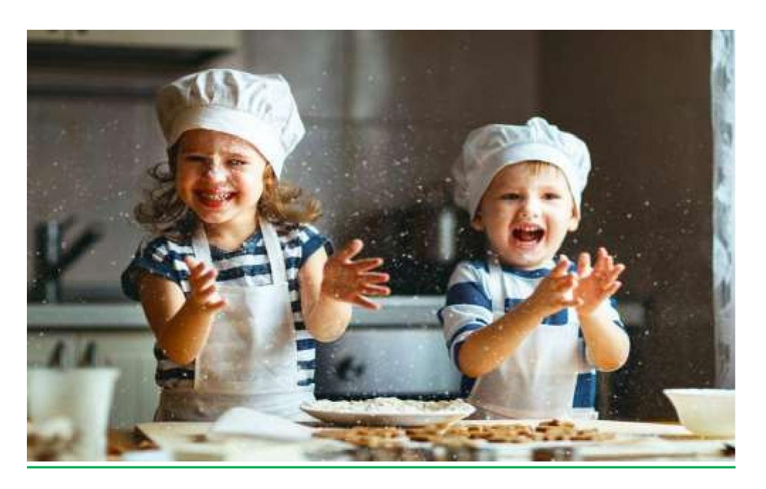
Grade -I to VIII